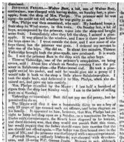
The Cambrian Juvenile freaks 1851

Why would Walter steal a pineapple? Think of all the reasons you can why he would do that. Make a class list!