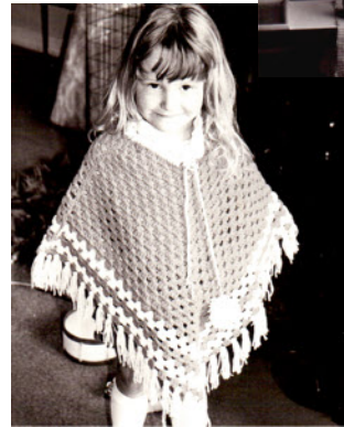
Poncho made by mum