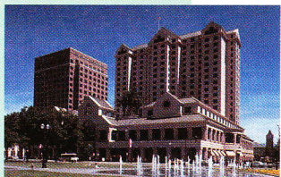
San Jose's Fairmont Hotel

San Jose, California, USA, The Capital of Silicon Valley, at the Fairmont Hotel & San Jose Civic Auditorium.