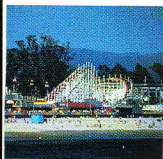
Hotel, Santa Cruz

San Jose is taurants, -class cultur- nd museums.