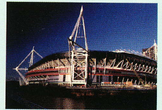
Millennium Stadium, Cardiff, Wales