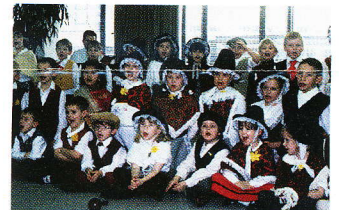
Traditional Welsh Costume

And to gain an insight into Welsh Culture today: