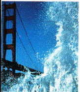
Golden Gate Bridge, San Francisco