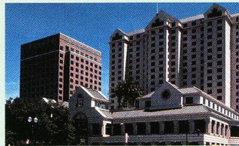
Fairmont Hotel, San Jose