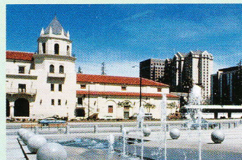
San Jose Civic Auditorium

Tours and individual activities will be arranged throughout the Festival