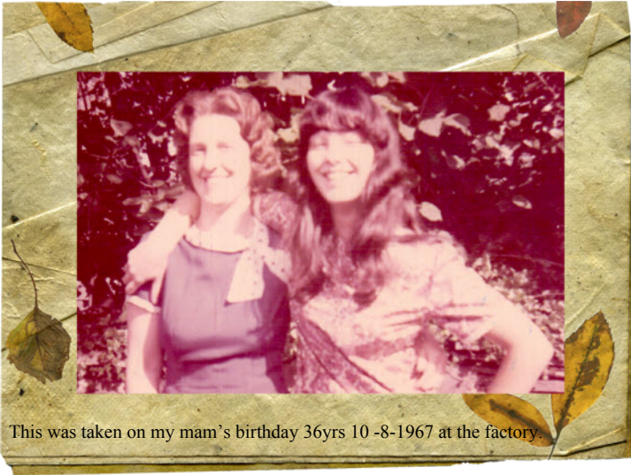
This was taken on my mam's birthday 36yrs 10 -8-1967 at the factory.