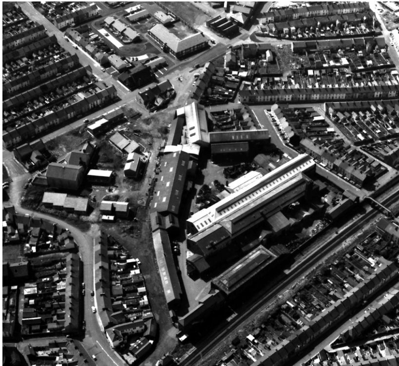
Image: Aerial view of the Morfa Foundry site, Machynis, Llanelli. Source: People's Collection Wales ( www.peoplescollection.wales ). Reproduced for heritage and educational purposes.