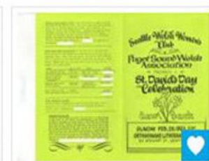
St. David's Day, Seattle 1993