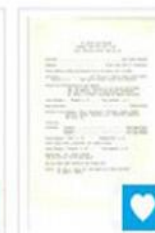
St. David's Day Program, Seattle,