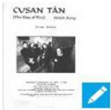
Concert by Cus...