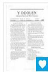
Y Ddolen, society