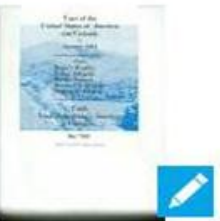
Seattle visit of...