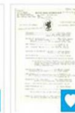
St. David's Day Program,