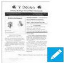
Y Ddolen, socie...