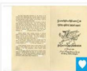
St. David's Day Program, Seattle, 1986