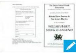
Welsh Harp, Song and L...