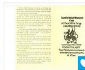
St. David's Day Program, Seattle, 1987