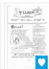
Y Llais, society newsletter