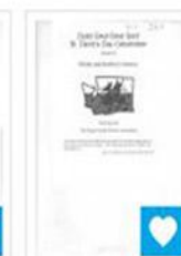
Seattle St. David's Day