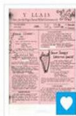
Y Llais, society newsletter