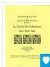
Seattle St. David's Day 2005