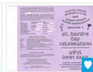
St. David's Day Program, Seattle, 2001