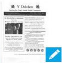
Y Ddolen, socie...