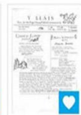
Y Llais, society newsletter