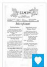
Y Llais, society newsletter