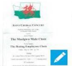
Concerts by th...