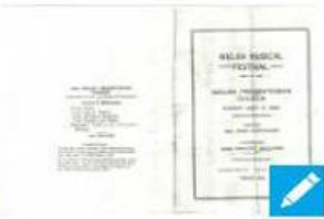
Welsh Musical Festival, ...