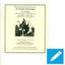
Poster and flye...