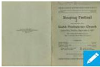
Singing Festival at Wels...