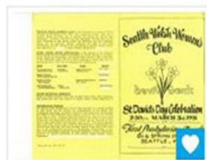
St. David's Day Program, Seattle, 1991