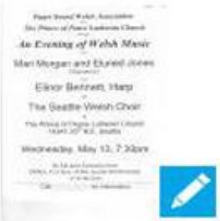
A Celebration o...