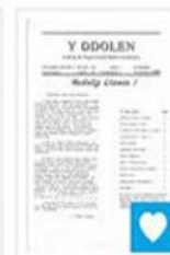
Y Ddolen, society