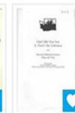
Seattle St. David's Day,