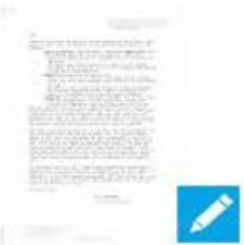
Llanelli Male C...