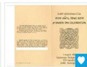
St. David's Day Program, Seattle, 1982