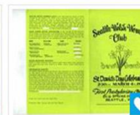
St. David's Day Program, Seattle, 1990