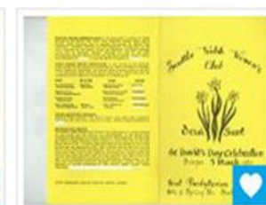
St. David's Day Program, Seattle, 1989