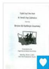
Seattle St. David's Day 2013