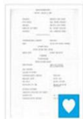
St. David's Day Program,