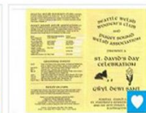
St. David's Day Program, Seattle, 2000