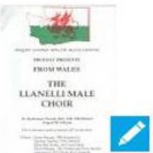
Llanelli Male C...