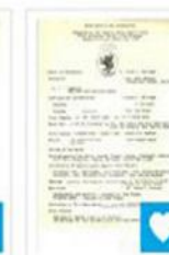
St. David's Day Program,