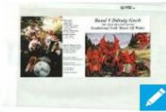
Covers for Band y Ddrai...