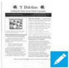
Y Ddolen, socie...