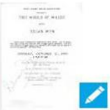
Eilian Wyn con...