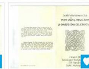
St. David's Day Program, Seattle, 1981