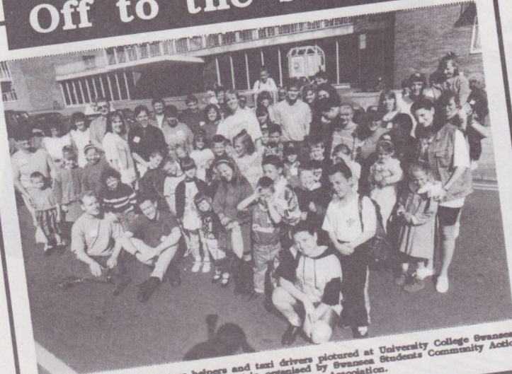
Children, students, volunteer helpers and taxi drivers pictured at University College Swansea before setting off for Barry Island on a trip organised by Swansea Students Community Action and the Swansea Taxi Owners Association.

KIDS AWAY Trips to Barry Island, an Xmas Party and a Treasure Hunt provide stimulation and fun for social services referred children.