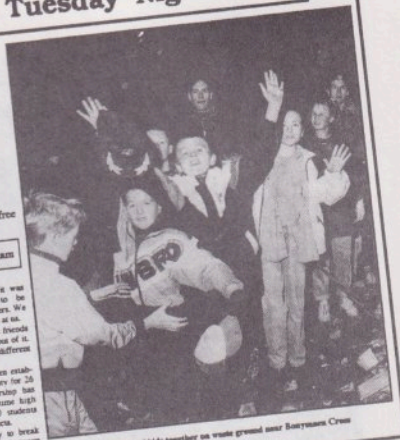
Students and kids together on town ground near Bonymaen Cross