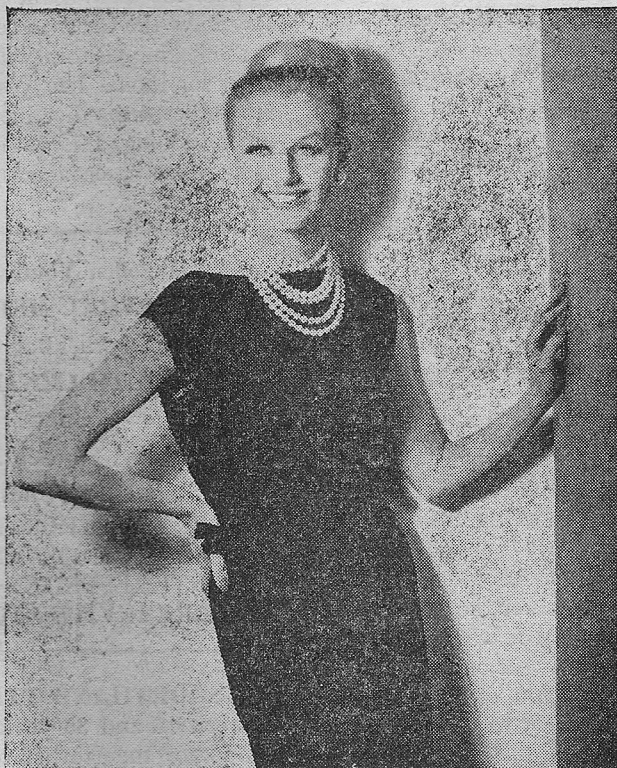
The Little Black Dress by Susan Small, with its low waist and simply styled bodice.