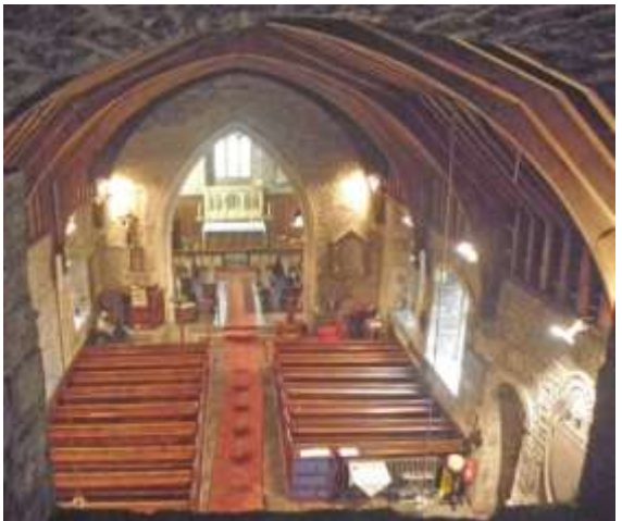
Looking into the body of the church from inside the tower