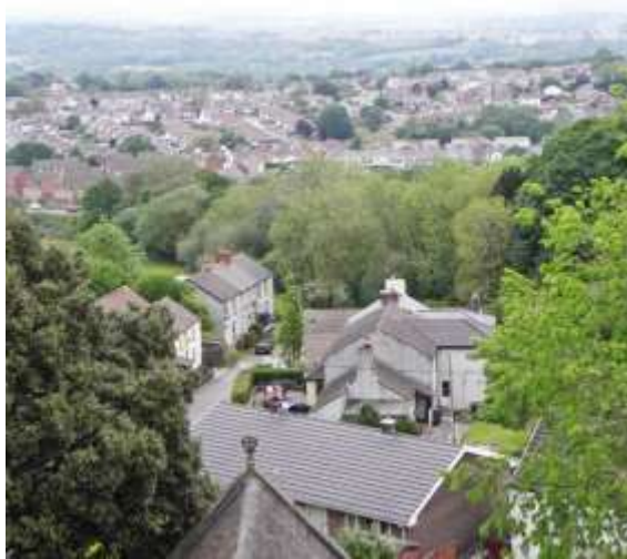
From the top of the tower