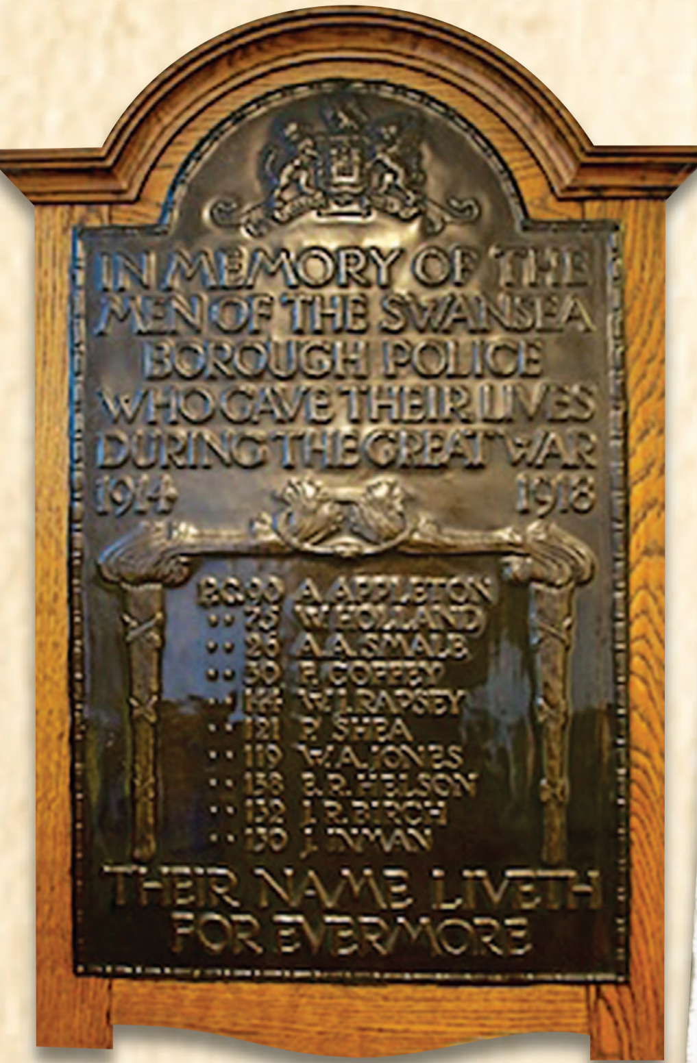
Swansea Borough Police War Memorial