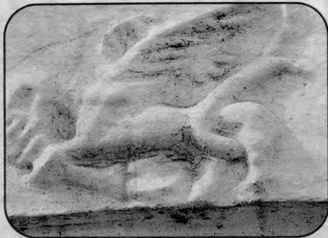
ABOVE: The griffin carving on the wall of the Ancient Druid.

A few years ago, it was an ancient rosary that illustrated its past as a chapel and hostel for pilgrims on the way to St Davids. Soon after, it was a boar's tusk.