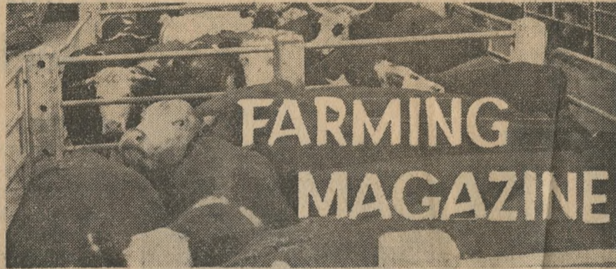
"COWBRIDGE, an expanding market, is one of the finest in the whole of South Wales for top quality fatstock."