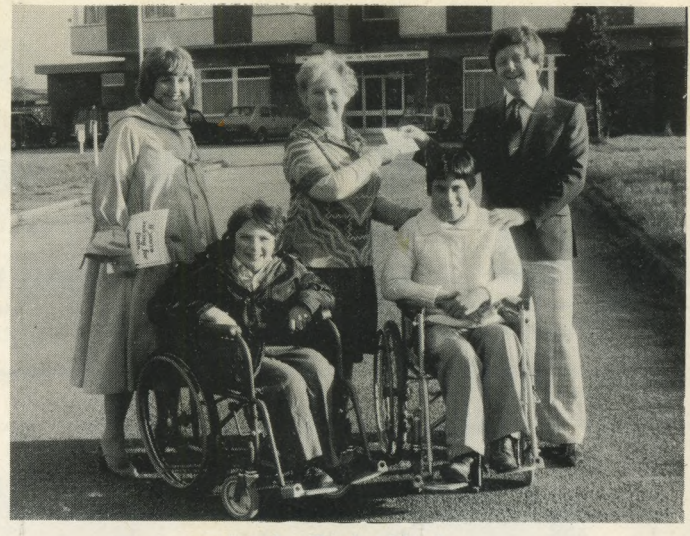
In the Right Mode

It should also be noted that our organisation was not large enough to be able to approach all the schools in the counties of Dyfed, Powys, Gwynedd and Clwyd.