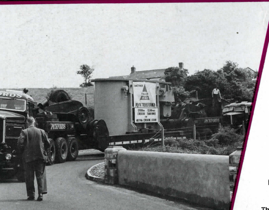
The transporter bringing the 132kV generator transformer to Aberthaw 'A' in

With the building of the new Power Station Aberthaw was once again put back on the commercial map of South Wales.