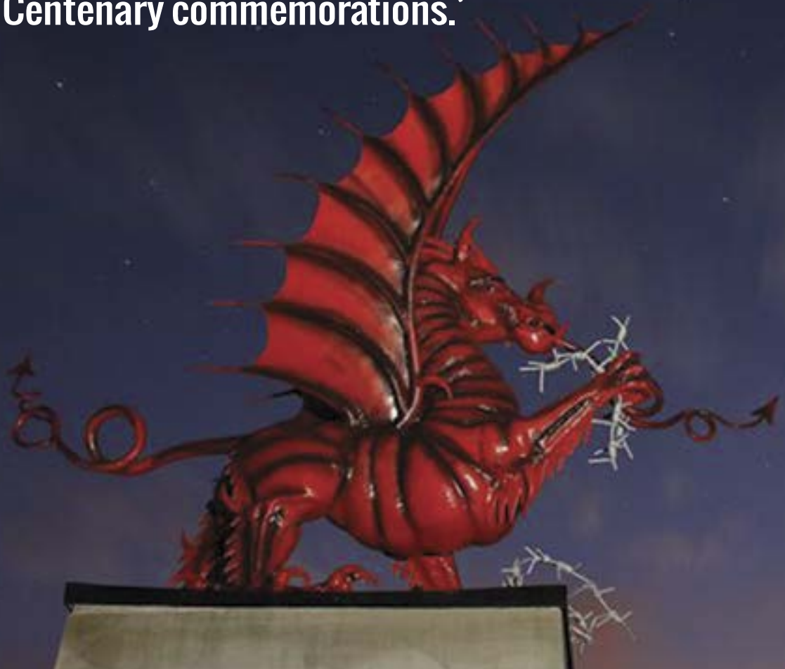
(top left) Image from the original dedication ceremony of the Mametz Memorial in the 1980s. (top left to right) Three images of the refurbishment of the Mametz Memorial Dragon by the Commonwealth War Graves Commission. (above) The newly repainted Memorial to the 38th (Welsh) Division at Mametz Wood, France.

‘The Dragon is now back in place ready for the beginning of the Centenary commemorations.’