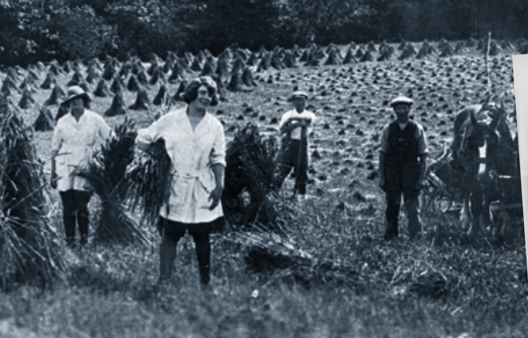
Land Army women working on the corn harvest in Powys, 1918.