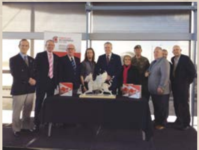
(left) Full size clay sculpture of the Welsh Memorial in Flanders Dragon, ready for casting in bronze. © Welsh Memorial in Flanders Campaign/Castle Fine Arts Foundry Ltd. (above left) The completed Cromlech in Langemark, Belgium. (above right) The First Minister of Wales, Minister for Culture & Sport, members of the Welsh Memorial in Flanders Campaign group and artist Lee Odishow at the launch of the winning design of the dragon for the Welsh Memorial in Flanders. © The Welsh Government