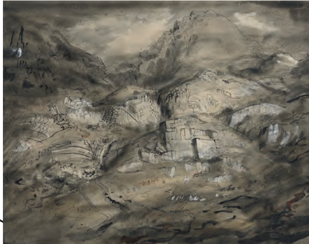
Head of Nant Ffrancon Pass

List all the things you can see in each painting, then list all the things that look the same.