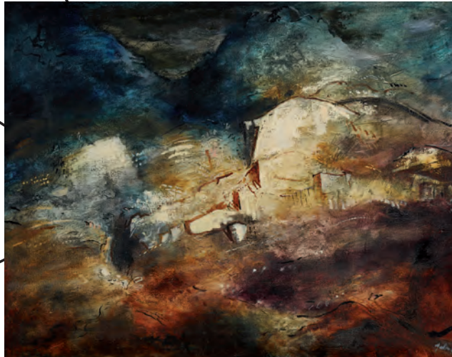
Rocky Valley © The Piper Estate / DACS 2015