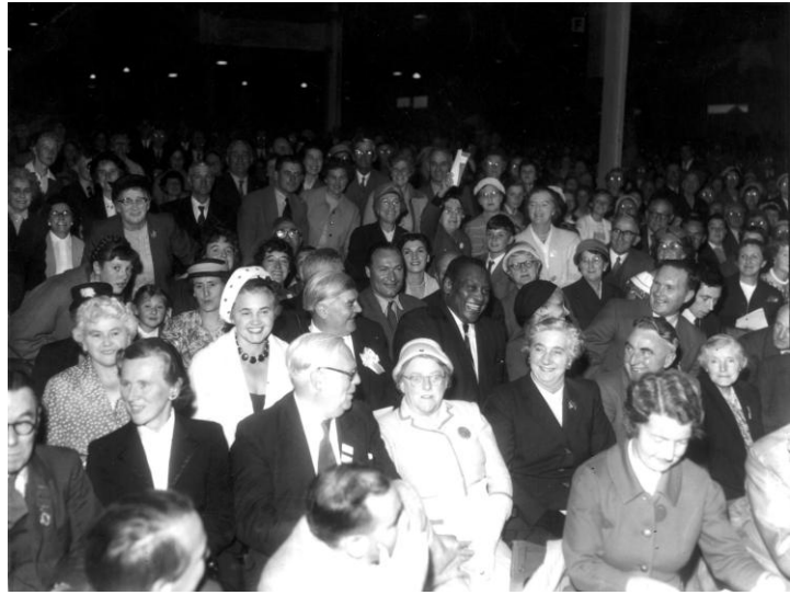
National Eisteddfod Ebbw Vale, 1958 National Eisteddfod Ebbw Vale with A Bevan, 1958

In July 1958 Paul Robeson and his wife Eslanda recovered their passports.