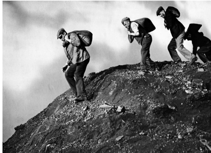
Proud Valley, 1940

In a moving centenary tribute to Paul Robeson held in New York's Carnegie Hall in 1998, the actors Whoopi Goldberg and Ossie Davis recalled the story of Robeson's first contact with the Welsh people in London: