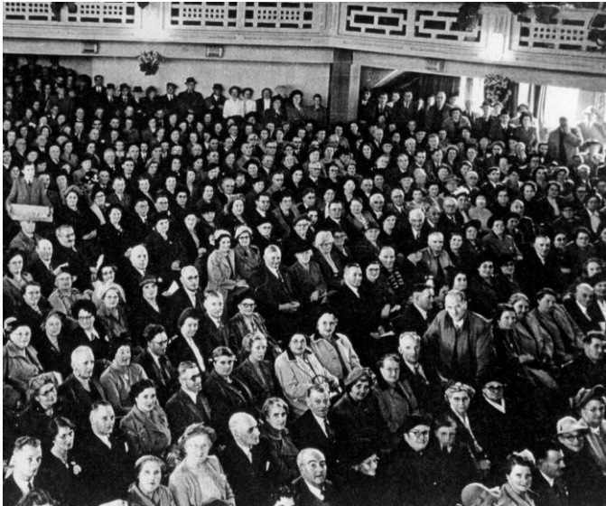
Porthcawl Miners Eisteddfod, 1957