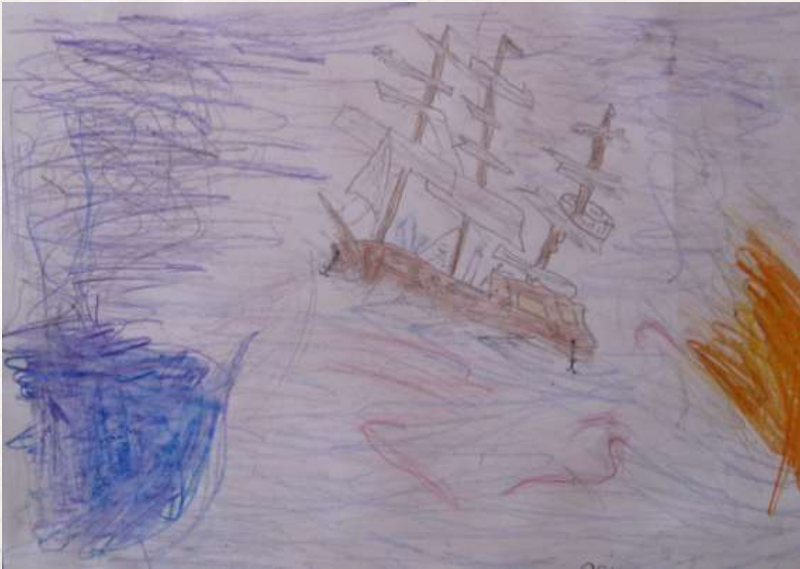
Drawing of the Royal Charter during the Great Storm of 1859.