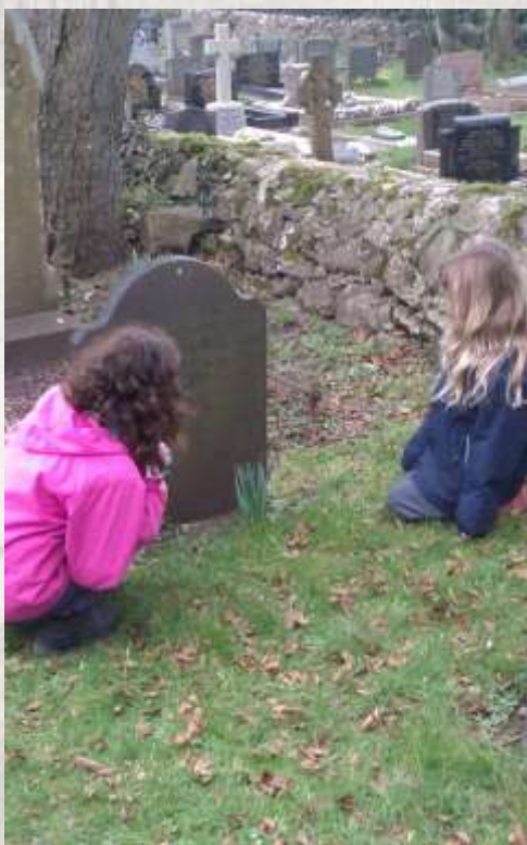
Pupils looking at grave of a sailor.