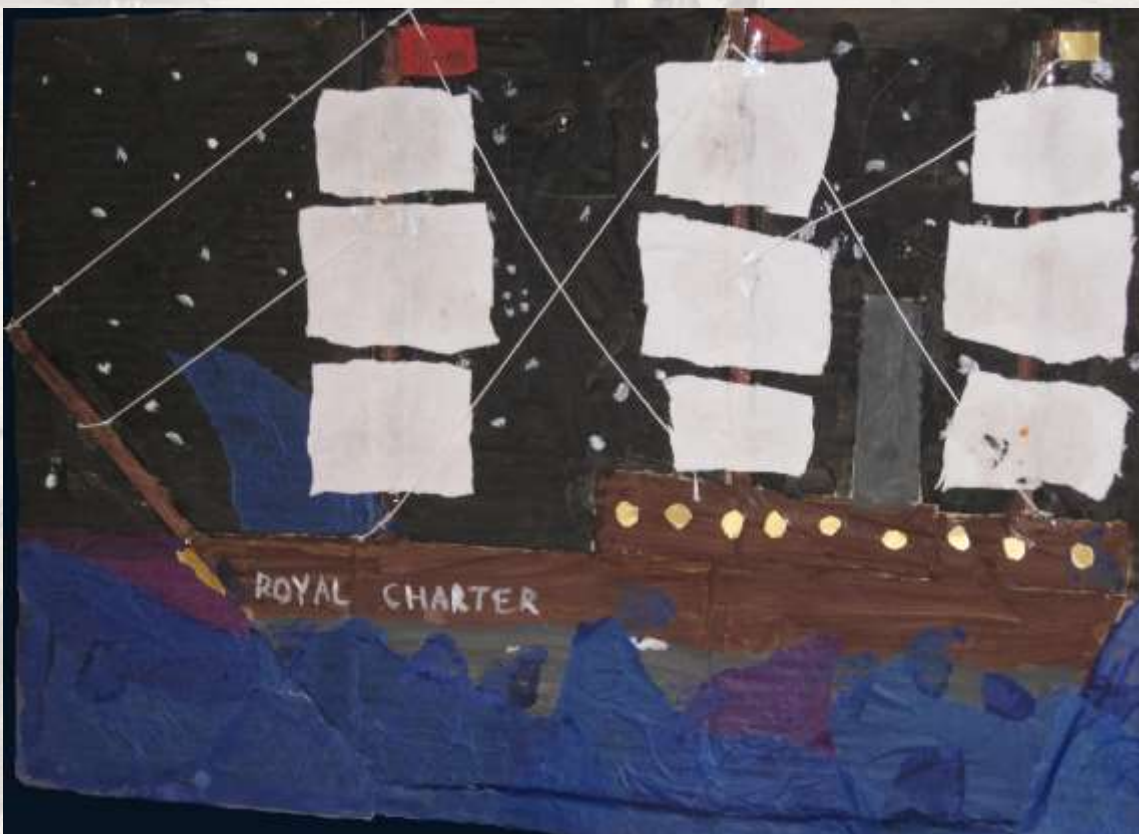
Collage of the Royal Charter during the Great Storm of 1859.