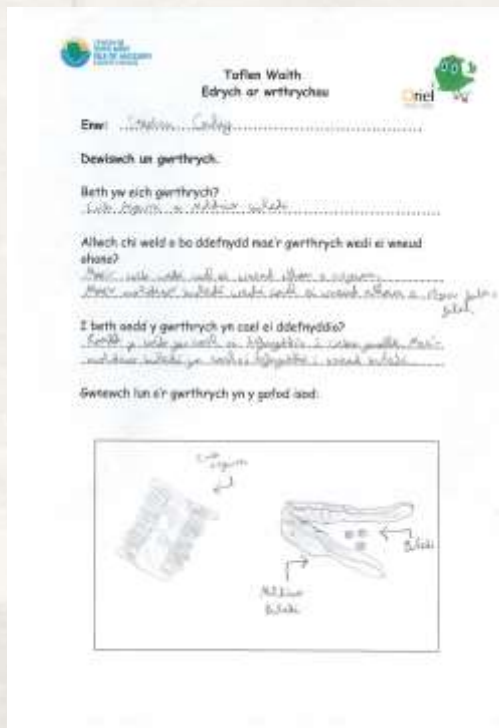
Pupil's worksheet from Oriol Ynys Môn.