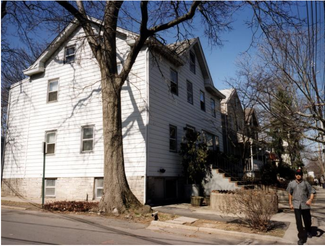
Witherspoon Street, Princeton

Find out where Paul Robeson grew up in the United States of America.