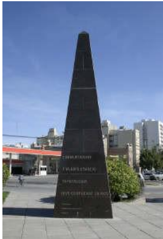
A memorial in Trelew to commemorate the centenary of the Welsh Settlement, 2005