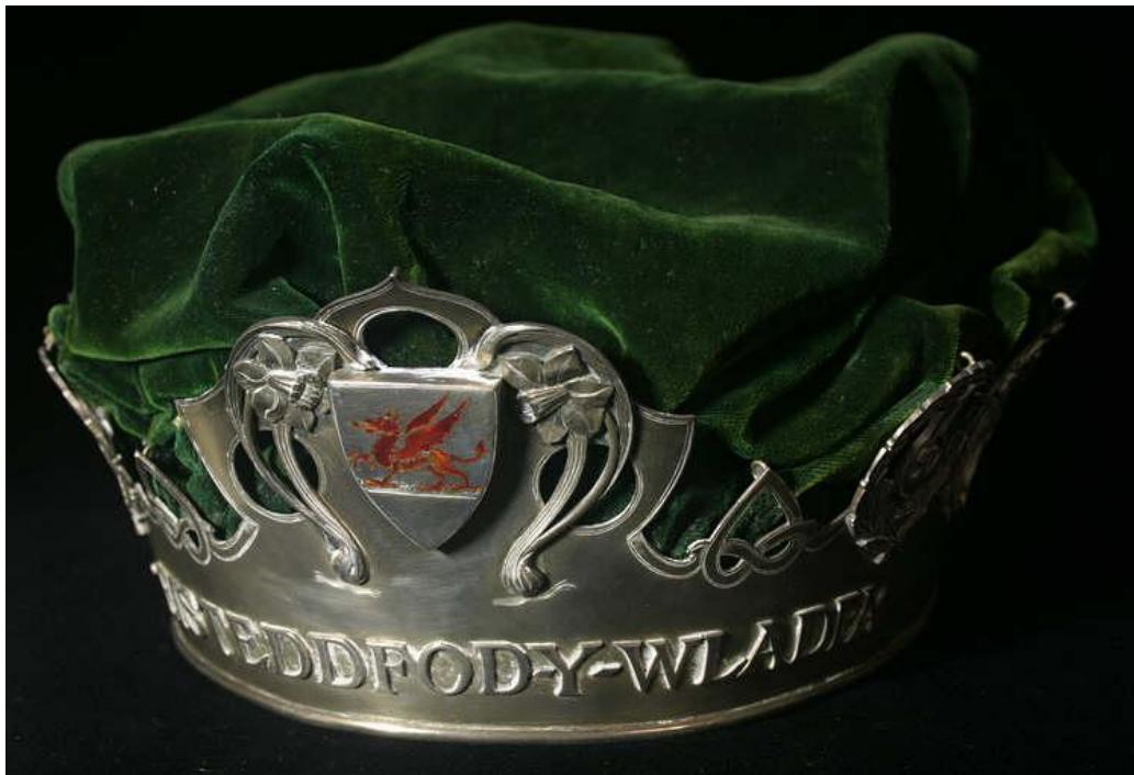
The crown of the Welsh Settlement's Eisteddfod

What symbols of Wales or Welshness do you see on this crown?