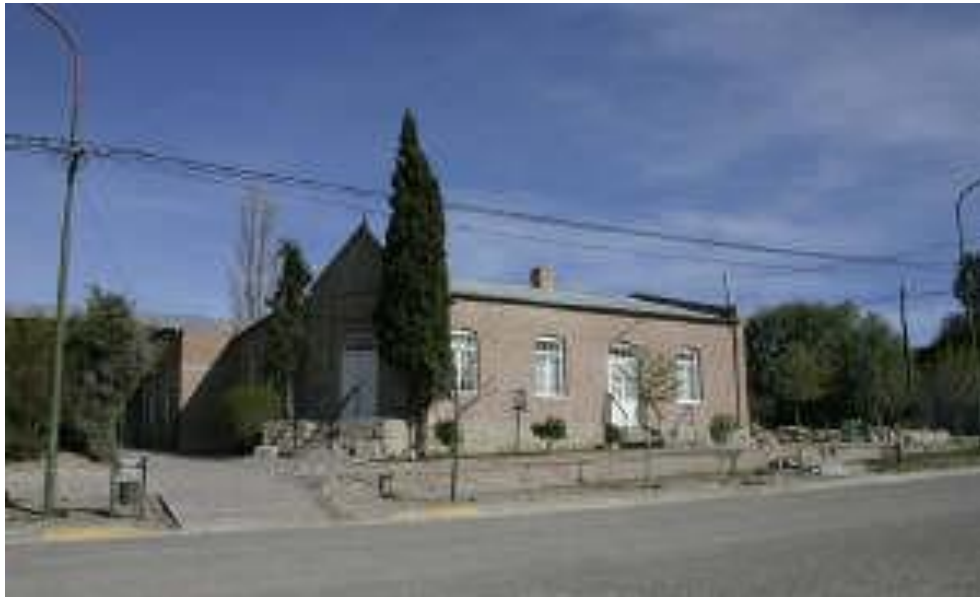
Gaiman secondary school - Coleg Camwy, 2005

Since its establishment in 1939, Cymdeithas Cymru-Ariannin (Wales-Argentina Society) has been an important link between Wales and Patagonia. It is a charitable organization which receives its income entirely from its members. The money is used to promote the Welsh connection by sponsoring exchange visits for teachers, students and ministers. Students from Patagonia are sponsored to attend Welsh courses at Lampeter every summer. Also, an annual competition is sponsored at the National Eisteddfod and education establishments in Patagonia.