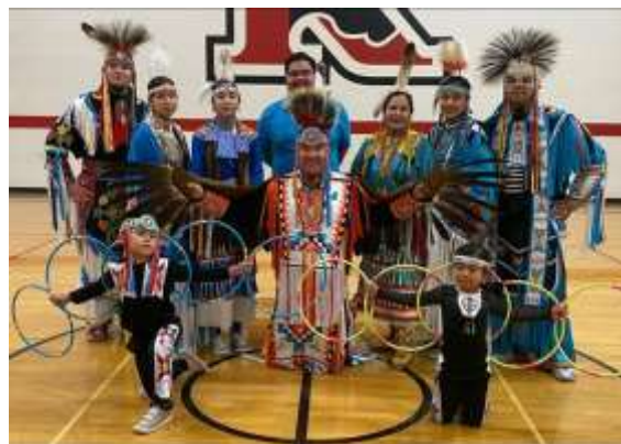
Many Moccasins is one of the featured local groups.

Check the website later in the year as plans unfold.