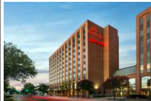
Lincoln Marriott Cornhusker Hotel, 333 South 13th Street, Lincoln, Nebraska

The festival hotel is located ten minutes from the Lincoln Airport; there is a hotel shuttle to the Lincoln Airport. Taxi transportation from the Lincoln Airport to the hotel is typically $15.00-$19.00.